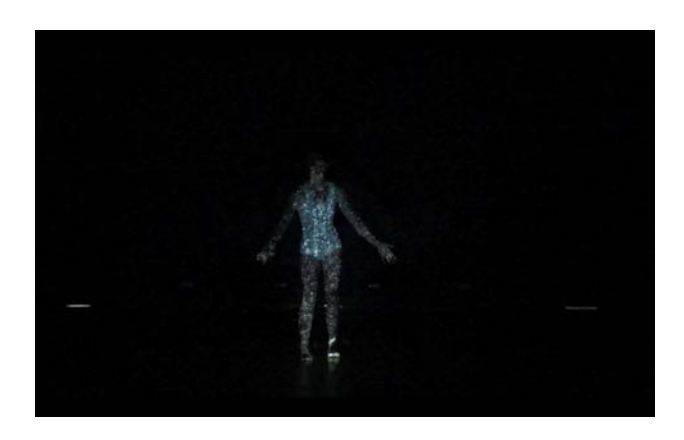
Figure 3. Moving particles from the fluid simulation are projected upon the performer. The performer uses their movements to stir the fluid, which flows over and through their body.

Our intention is that the appearance and behaviour of the software-simulated fluid will be intuitively understandable for both performers and audience, yet complex enough to facilitate conversational interactions.