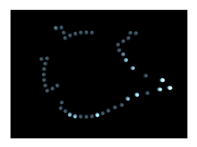
Figure 1. Screenshot from Partial Reflections 3 , showing the simulated physical sculpture responding to sounds played on an acoustic instrument.

Physical modelling techniques have a long history in sound synthesis (Smith, 2004). Traditionally the approach has been to create high-fidelity models of the sound producing mechanisms of real-world musical instruments in order to produce more realistic synthesised sounds. One could say that rather than trying to build a violin sound , the idea is to create a simulated violin. If the simulation is accurate the sound it produces will be realistic.